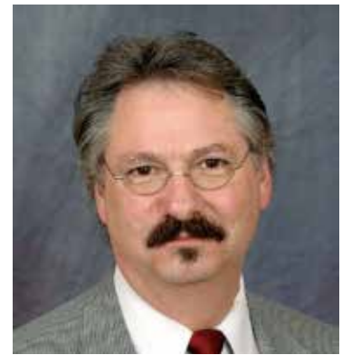
Mark Sheperdigian Outstanding Alumni Award